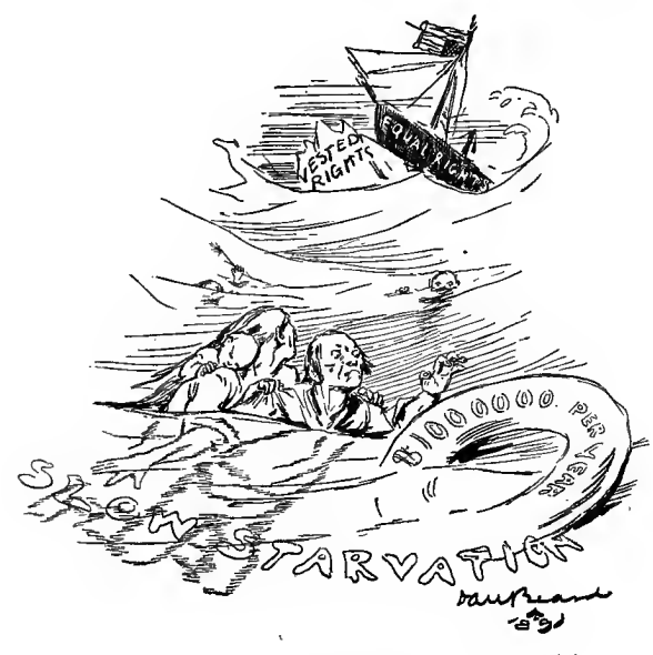
"FOOL OR NO FOOL, HE WOULD GRAB IT."

Anybody would. Anybody that's alive. And I've seen dead people that would get up and go for it. I would myself."